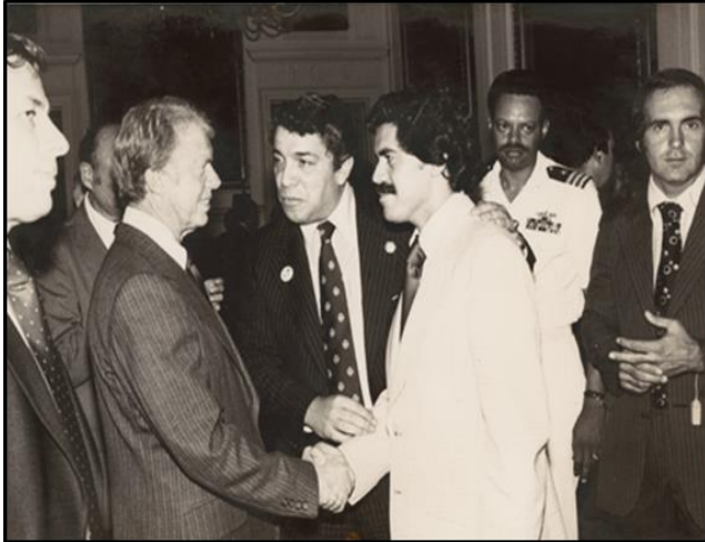
Robert Garcia introducing New York State Assemblyman José Serrano, who would become his successor as U.S. Representative of the South Bronx, to President Jimmy Carter.

The fiscal conservatism of the 1980s was characterized by large scale budget cuts, particularly to social welfare programs. Garcia charged that the Reagan cuts would hurt the Bronx more than any other urban area in the country. He also decried the disproportionate affect these policies had on the Hispanic community, with the lowest level of educational attainment, a higher than average unemployment and poverty level, and high incidences of housing discrimination. Garcia also fought the Reagan administration's efforts to restructure and take control of the U.S. Civil Rights Commission. Garcia introduced legislation to reduce teenage pregnancy, a nationwide problem reaching epidemic proportions in New York, particularly the South Bronx. Garcia was also an outspoken advocate for bilingual education. He helped to establish the Office of Bilingual Education and Minority Language Affairs (OBEMLA) in the new Department of Education, charged with helping school districts meet their responsibility to provide equal education opportunities to limited English proficient children.