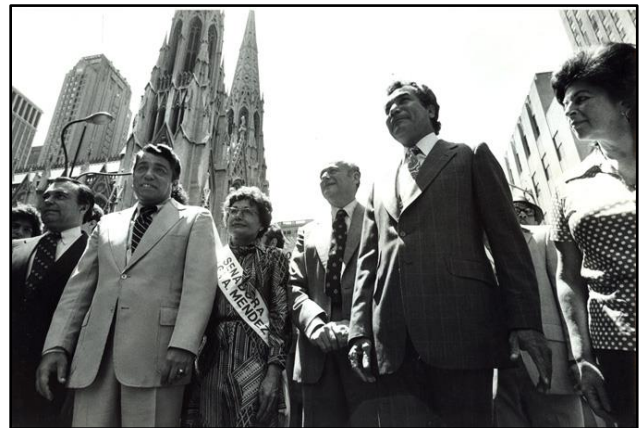
Inauguración de Olga en el Senado del Estado de Nueva York, de pie junto a Robert García, Herman Badillo y el alcalde Ed Koch. Albany, 1 de Noviembre., 1979

En 1978, el congresista demócrata Herman Badillo renunció a su escaño en el Congreso porque fue nombrado Subalcalde por Ed Koch. El senador del estado de Nueva York Robert García ganó en una elección especial y reemplazó a Badillo, creando una vacante en el Senado. El distrito de García comprendía el East Harlem, partes del sur del Bronx, Washington Heights y Roosevelt Island; fue considerado como uno de los distritos más pobres del estado. En abril de 1978 Méndez ganó una elección especial, con el 89% de los votos, para suceder a García y se convirtió en la primera mujer puertorriqueña en ser elegida para una legislatura estatal en todo el territorio de Estados Unidos. Fue elegida durante 13 periodos consecutivos para representar al Distrito 30 en el Senado; cambió al Distrito 28 en 1992 después de una redistribución de distritos y con altos porcentajes de votación.