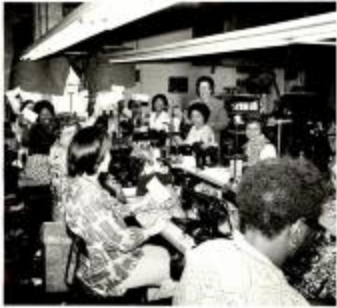
Women in the Garment Industry (KaAn_b01_f34_0001)