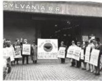
Delano Grape Strike (KaAn_b_f23_0006)