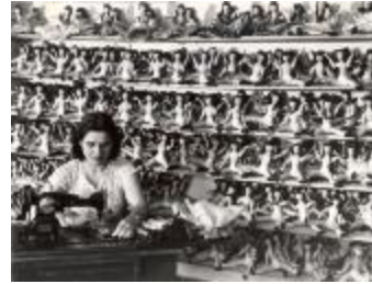
Dollmaker sewing at her desk (OGPRUS_OIPR_b3374_f31_0001)