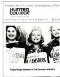
Puerto Rican Women in the Garment Industry (EICa_b08_f_0004_cover)