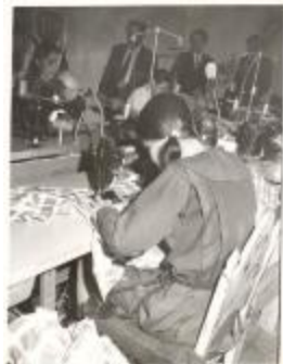
Garment worker sewing clothing (SoPe_b01_f01_0004)