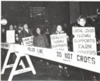
ILGWU Supports Farm Workers (KaAn_b_f23_0005)