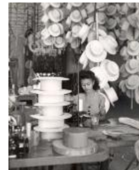
Straw and Fiber Hats (OGPRUS_OIPR_b3315_f09_0001)