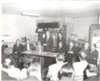
Puerto Rican Politicians and Union leader (JAMa_b65_f01_0002)