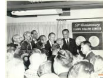
Lyndon B. Johnson At 50th Anniversary of ILGWU Health Center (OGPRUS_MD_b25_fDa43-2_0001)