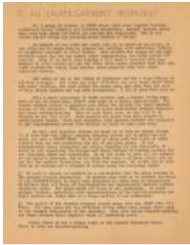
To All Ladies Garment Workers! (CICo_b02_f13_0001_pg01)