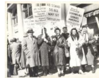
ILGWU Protest (KaAn_0001)