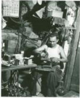
Cobbler repairing a shoe (OGPRUS_OIPR_b3322_f29_0001)