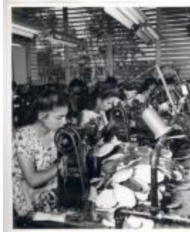
Needle workers (OGPRUS_MD_b21_fCh1- 1_0001)