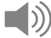
Nosotras Trabajamos en la Costura Radio Program (Spanish) (PRNYVM.NTELC.RadioProgram.Spanish)