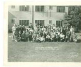
Spanish Group Dressmakers' Union (JeCo_b44_f24_0001_front)