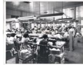
Factoria de ropa interior / Clothing Factory interior (OGPRUS_MD_0029)