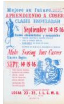
Mejore su future: Aprendiendo a coser (KaAn_b08_f11_0002)