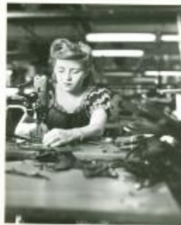
Garment worker at sewing machine (OGPRUS_MD_boxunknown_0002)