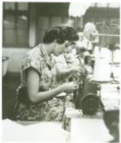
Garment worker at sewing machine (OGPRUS_MD_boxunknown_0001)