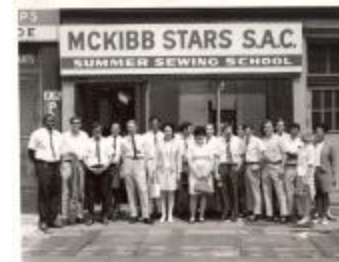
McKibb Stars S.A.C. - Summer Sewing School (SoPe_b01_f02_0004)