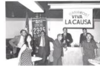
Local 23-25 Union (KaAn_b_f23_0001)