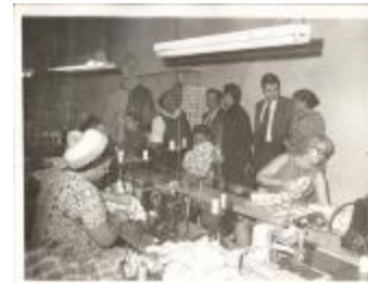
Garment workers sewing (SoPe_b01_f01_0002)