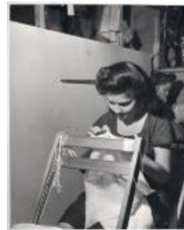
Hemming handkerchiefs (OGPRUS_OIPR_b17_0001)