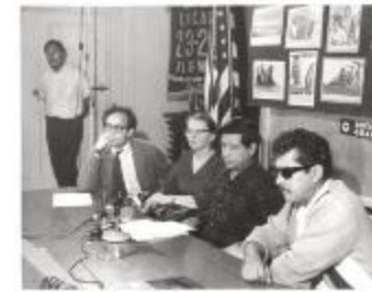
Cesar Chavez at a meeting with ILGWU (KaAn_b_f24_0001)