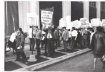
Local 23-25 ILGWU Supports Farm Workers (KaAn_b_f23_0007)