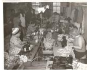
Garment workers sewing (SoPe_b01_f01_0005)