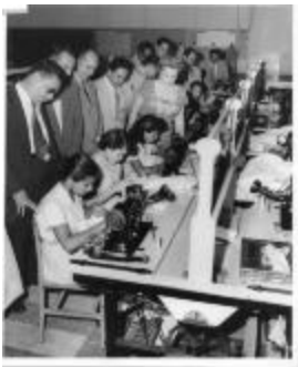
Mujeres Cosiendo / Women Sewing (OGPRUS_MD_0053)