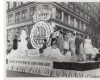
The International Ladies Garment Workers Union float (JAMa_b57_f01_0006)