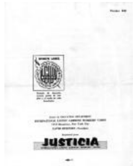
Porque El Obrero debe VOTAR (JeCo_b21_f08_0004)