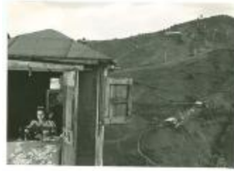
Rural farm worker sewing in her home (OGPRUS_OIPR_b3334_f07_0001)