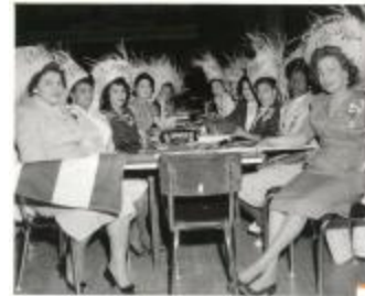
Members Of The International Ladies Garment Workers Union Wearing Their Traditional Pavas (OGPRUS_MD_b22_fDa7-2_0001)