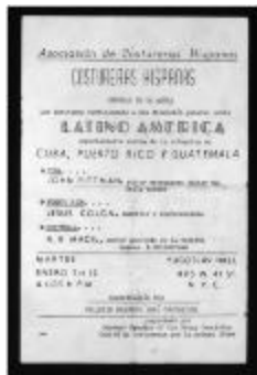
Latino America - Cuba, Puerto Rico, Y Guatemala (JeCo_b01_f06_0254)