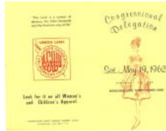
Congressional Delegation (KaAn_b08_f13_0001_front)