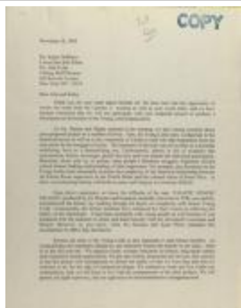
Correspondence from Former Young Lords Party Members (RiPe_b34_f01_0031_pg01)