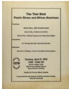
Ties That Bind: Puerto Ricans and African Americans (RiPe_b20_f04_0004)