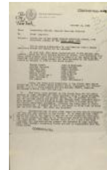
Correspondence from Special Services Division of the NYPD (RiPe_b34_f01_0016_pg01)