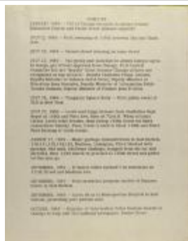
Timeline of Young Lords Party (RiPe_b34_f01_0033_pg01)