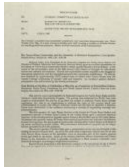
Report For 1994-1995 Programmatic Year (RiPe_b25_f07_0020_pg01)