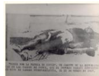
Morir por la Patria es Vivir / To die for the Motherland is to Live (RMRe_b39 Morir por la Patria es Vivir)