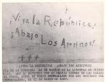
Viva La Republica! Abajo Los Asesinos! / Long Live the Republic! Down with Assassins! (RMRe_b39 ¡Viva la República!)