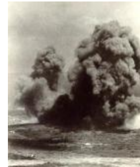
Large cloud of smoke at the marina (RMRe_marina9)