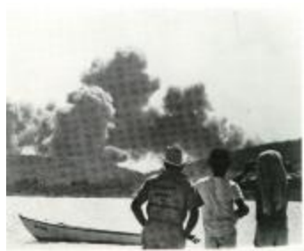
Three people looking at large clouds of smoke (RMRe_marina6)