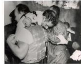
Pedro Albizu Campos being carried after police takeover at Nationalist Party event (RMRe_b38_f02_0001)