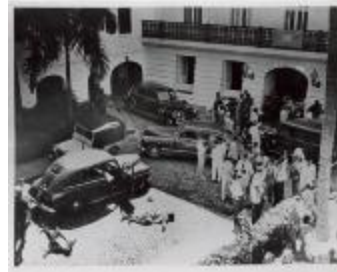
Crime Scene (RMRe_b39_f02_0008)