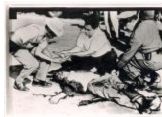
Casualty in Peñuelas (RMRe_b39_f01_0003)