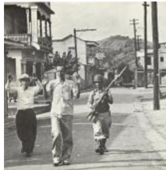
Men followed by soldier (RMRe_b37_f06_0001)