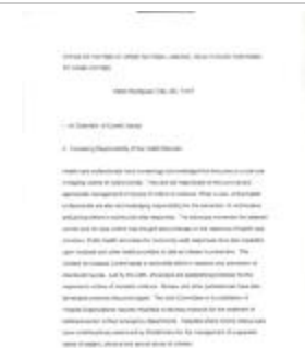
Office of Victims of Crime National Agenda: Health Care Response to Crime Victims (HeRo_b02_f09_0001)