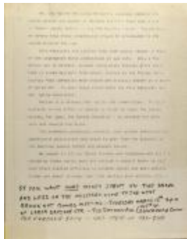
Statement by the "Bronx Not Bombs" Network (RiPe_b19_f09_0005)