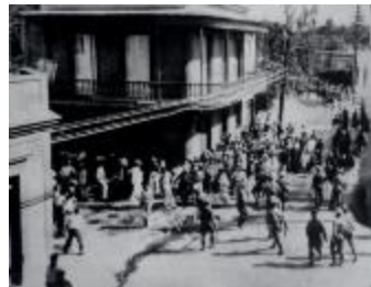
Police and civilians fighting in the streets of Puerto Rico (RMRe_b39_f04_0002)