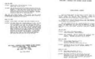
Racial Attacks - Belmont (LoTo_b07_f16_566_01)