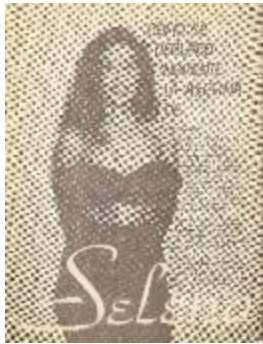
Como Se Declaro Inocente La Asenina De . . . / How To Declare Innocent The Murder Of . . . (LARI_0151_pg07-10)