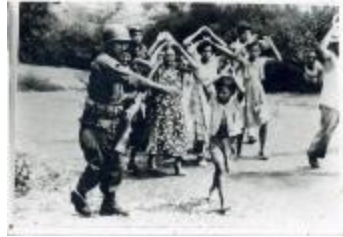
Soldiers Rounding People Up (RMRe_b39_f02_0006)