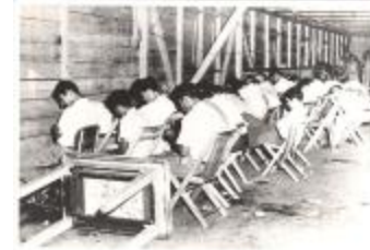
Men Being Held for Investigation - Week of Revolution (RMRe_b39_f02_0010_front)