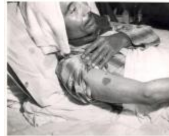
Albizu Campos' Arm (RMRe_b38_f01_0006)