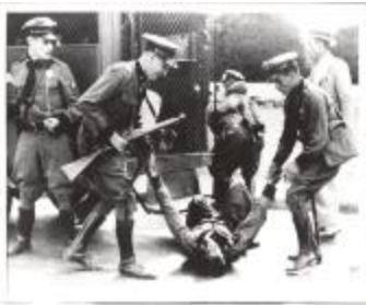
Soldiers taking revolutionaries into custody (RMRe_b39_f02_0011)