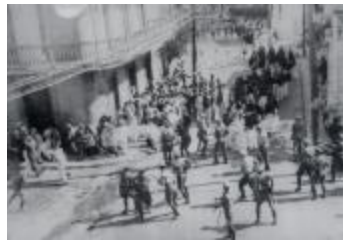
Fighting between police and civilians in the streets of Puerto Rico (RMRe_b39_f04_0001)