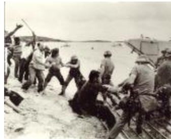
Police and civilians fighting at the marina (RMRe_marina8)