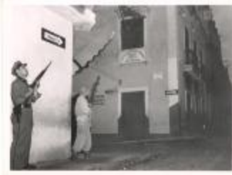
Takeover of Nationalist Party (RMRe_b38_f02_0003)