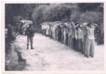
Soldiers Rounding People Up During 1950 Revolts (RMRe_b39_f01_0002)