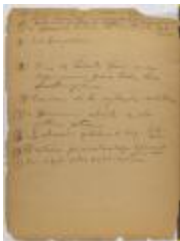
Notes on Casa de Puerto Rico (JeCo_b15_f06_0015)