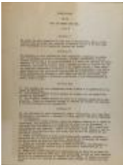
Constitucion de la Casa de La Puerto Rico, Inc. (JeCo_b15_f06_0014_pg01)