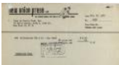
New Union Press receipt (JeCo_b15_f06_0008)