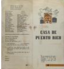
Casa de Puerto Rico (JeCo_b15_f06_0001_pg01)