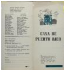
Casa de Puerto Rico (JeCo_b15_f06_0002_pg01)