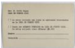
Membership card for La Casa de Puerto Rico (JeCo_b15_f06_0005)