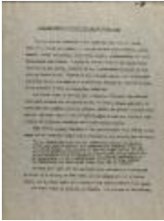
Plan and Tentative Budget for Casa de Puerto Rico (JeCo_b15_f06_0011)