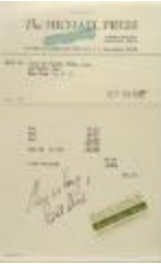
The Michael Press invoice statement (JeCo_b20_f02_0021_pg01)