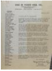
Correspondence from Casa de Puerto Rico (JeCo_b15_f06_0010)