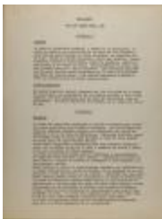
Reglamento - Casa de Puerto Rico, Inc. (JeCo_b15_f06_0013_pg01)