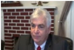
Interview with John Quinones on January 19, 2017, Segment 9 (JQui.2017.01.19.9)