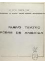
Nuevo Teatro Pobre de América / New Poor Theater of America (JeCo_b15_f06_0017_cover)