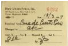
New Union Press, Inc. payment receipt (JeCo_b20_f02_0047)