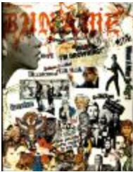
Cover page publication (EICa_b09_f_0074)