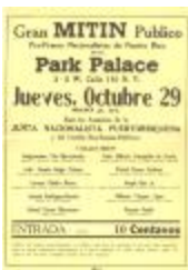
Gran Mitin Publico (EmVe_b02_f16_0001)