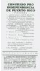
Congreso Pro Independencia de Puerto Rico (EmVe_b08_f26_0001)