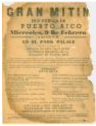
Gran Mitin (EmVe_b07_f20_0003)