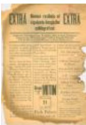
Extra Extra (EmVe_b07_f20_0002)