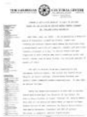
A Call to Action (EICa_b07_f_0004_pg01)