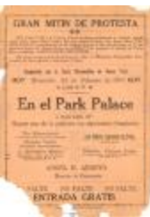
Gran Mitin de Protesta (EmVe_b02_f16_0002)