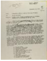
Correspondence from Special Services Division of the NYPD (RiPe_b34_f04_0009_pg01)