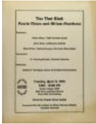
Ties That Bind: Puerto Ricans and African Americans (RiPe_b20_f04_0004)