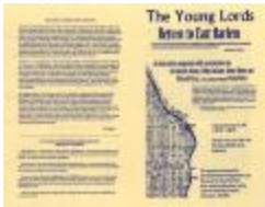
The Young Lords Return to East Harlem (RiPe_0099)