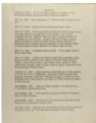
Timeline of Young Lords Party (RiPe_b34_f01_0033_pg01)