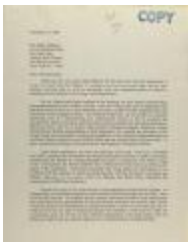
Correspondence from Former Young Lords Party Members (RiPe_b34_f01_0031_pg01)