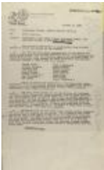
Correspondence from Special Services Division of the NYPD (RiPe_b34_f01_0016_pg01)