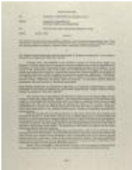
Report For 1994-1995 Programmatic Year (RiPe_b25_f07_0020_pg01)