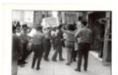
Protest Against PBS to Keep TV Program Realidades On the Air (MaCo_b219_f02_0003)