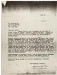
Correspondence from Jesús Colón (JeCo_b15_f05_0031)