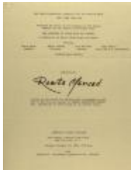
The Discovery of Puerto Rico Day Concert (PuBe_b25_f07_0024_pg01)