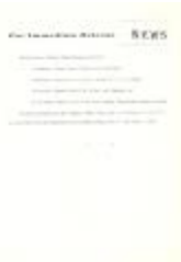
Latin Close-Up Broadcast Schedule (LARI_0115)