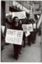
Protest Against PBS to Keep TV Program Realidades On the Air (MaCo_b219_f02_0004)