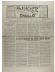
Ateneo Obrero Hispano de Nueva York (JeCo_b15_f05_0038_pg01)