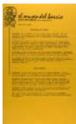
El Museo Del Barrio - Comunicado de Prensa / Press Release (PuBe_b26_f04_0004)