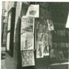
Street Vendors (OGPRUS_OIPR_b3322_f26_0001)