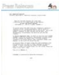
A New Life After Prison (VNBC_b02_f_0001)