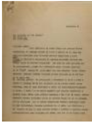
Correspondence from Jesús Colón (JeCo_b15_f05_0030_pg01)