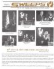
Sweeps - The New York Chapter of the National Television Academy (LARI_0166_pg01)