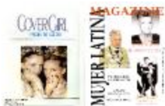
Mujer Latina Magazine (LARI_0099_pg01-16)