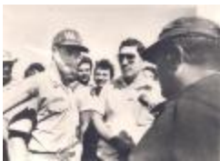
Military officials being interviewed (RMRe_b03_f03_0001)