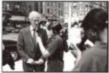
Teens interviewing man as part of a Police Athletic League program (CaOr_b21_f19_0023)