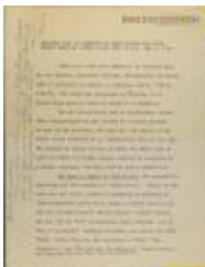
Original Play By Director of Mobilization for Youth Offers Slice of Puerto Rican Life in N.Y. (PuBe_b25_f08_0047)