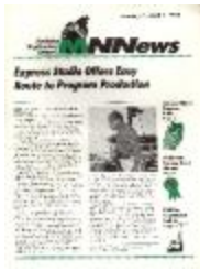
Manhattan Neighborhood Network (LARI_0162_01-14)