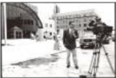
News reporter in front of the Police Athletic League (CaOr_b21_f19_0026)