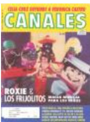
Canales Magazine (LARI_0167_cover)