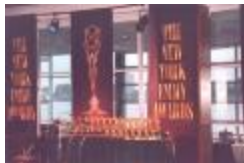
New York Emmy Awards (LARI_0135_front)