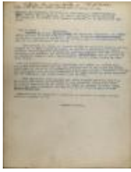
Copia de una carta a la prensa / Copy of a letter to the press (JeCo_b15_f05_0071)