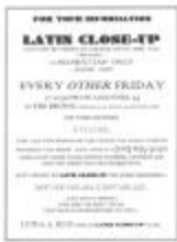
Latin Close-Up flyer (LARI_0121)