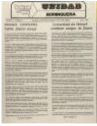
Newark Community Fights Dioxin Threat / Comunidad en Newark combate peligro de Dioxin (RiPe_b19_f07_0007_pg01)