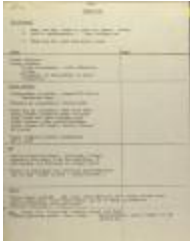
Media and Press Agenda for Protests (RiPe_b20_f08_0043)