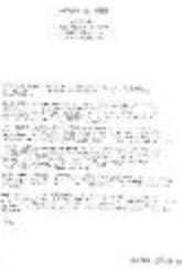
Latin Close-Up and Conversation with Linda press release (LARI_0107_pg01-08)