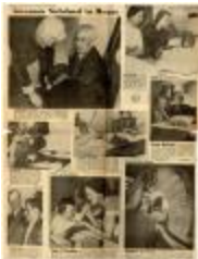
Gunman Subdued in House (OGPRUS_OIPR_b3298_f05_0001)