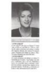
Latin Close-Up TV listing (LARI_0116_front)