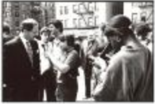
Teens interviewing man as part of Police Athletic League program (CaOr_b21_f19_0021)