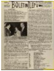
Boletín Tlepu / Bulletin Tlepu (PuBe_b25_f07_0022_pg01)