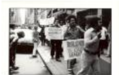
Protest Against PBS to Keep TV Program Realidades On the Air (MaCo_b219_f02_0002)