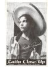
Latin Close-Up promotional advertisement (LARI_0169)