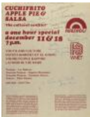
Cuchifrito, Appie Pie & Salsa - "The Cultural Conflict" (PuBe_b25_f08_0050)