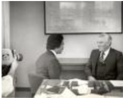
Governor Carlos Romero Barcelo interview in the Migration Division Office (OGPRUS_DPRCA_0024)