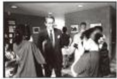
Teens interviewing man as part of Police Athletic League program (CaOr_b21_f19_0022)