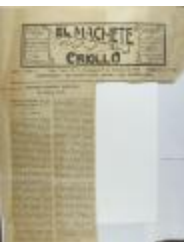
Ateneo Obrero Hispano de Nueva York (JeCo_b15_f05_0045_pg01)