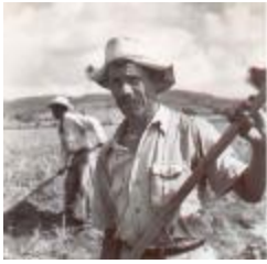
Agricultural worker in the fields (OGPRUS_OIPR_b3331_f12_0001)