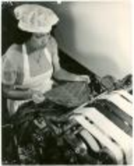
Milling and Refining (OGPRUS_OIPR_b3304_f44_0001)