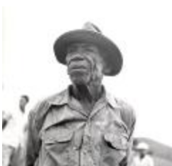
Migrant worker (OGPRUS_OIPR_b3331_f38_0001)