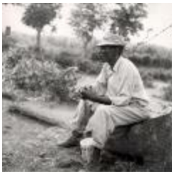
Agricultural worker (OGPRUS_OIPR_b3331_f48_0001)