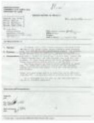
Chicago Progress Report (OGPRUS_MD_0018)