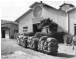
Puerto Rico Farm Land (OGPRUS_OIPR_2948)