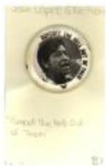
Button: Boycott the hell out of them (Button_b04_B1_JoLo_0001)