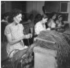
Migrant Farm Workers (OGPRUS_OIPR_0380)