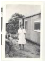
Carvalho woman in a Hawaiian sugar cane plantation (BCSo_b12_f11_0005)