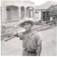
Rural portrait of young agricultural worker (OGPRUS_OIPR_b3331_f03_0001)