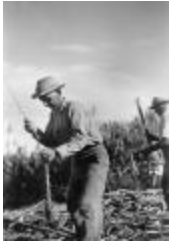
Migrant Farm Worker (OGPRUS_OIPR_0751)