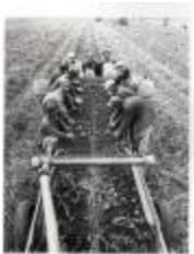
Potato farm workers (OGPRUS_MD_0064)