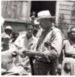
Distribution of Proportional Benefit Payments to Farm Workers (OGPRUS_OIPR_b3311_f14_0001)