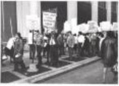
Local 23-25 ILGWU Supports Farm Workers (KaAn_b_f23_0007)