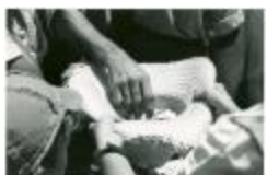
Distribution of Proportional Benefit Payments to Farm Workers (OGPRUS_OIPR_b3311_f07_0001)