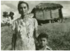
Farm worker and child outside of their home (OGPRUS_OIPR_b3333_f04_0001)