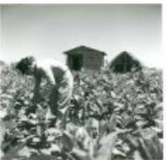
Farm worker in tobacco field (OGPRUS_OIPR_b3375_f15_0001)