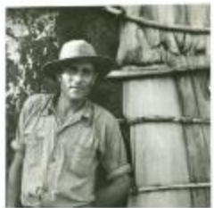
Rural portrait (OGPRUS_OIPR_b3330_f60_0001)