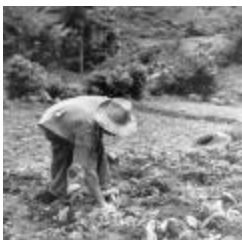
Farm Worker (OGPRUS_OIPR_0474)