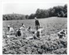
Strawberry Pickers (OGPRUS_MD_0032)