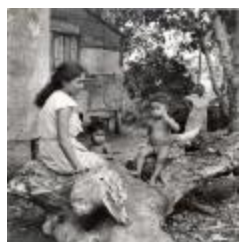
Rural farm family outside their home (OGPRUS_OIPR_b3332_f47_0001)