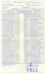
Farm Workers Passengers' Manifest (OGPRUS_MD_0027)