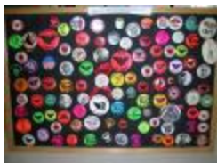
Farm Workers' Rights Buttons (EdLo_0003)