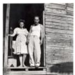
Rural farm workers on the porch of their home (OGPRUS_OIPR_b3332_f42_0001)