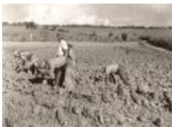
Planting, weeding, sugarcane (OGPRUS_OIPR_b3303_f02_0001)