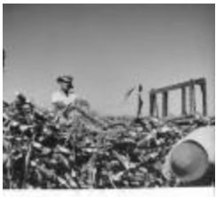
Migrant Worker Performing Farm Work (OGPRUS_OIPR_1517)