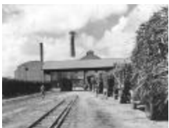
Farm Land Work (OGPRUS_OIPR_1641)