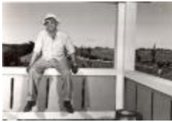
Rural farm worker sitting on porch (OGPRUS_OIPR_b3333_f50_0001)