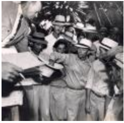
Resettlement of "Agregados" (OGPRUS_OIPR_b3309_f21_0001)