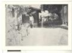
Man in a Hawaiian sugar cane plantation (BCSo_b12_f11_0003)