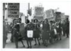
Protest in Support of Farm Workers' Rights (KaAn_b01_f23_0001)