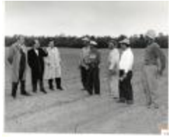
Luis Muñoz Marín & Laborers In A Field (OGPRUS_MD_b23_fDa19-6_0001)