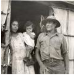
Rural farm family in front of their home (OGPRUS_OIPR_b3333_f08_0001)