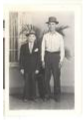
Two men in hat and suit (BCSo_b12_f11_0007)