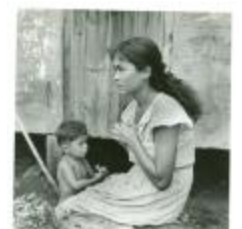
Farm worker and child outside their home (OGPRUS_OIPR_b3332_f48_0001)