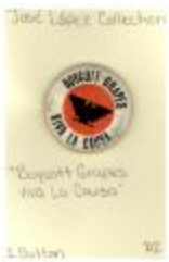
Button: Boycott grapes, Viva la causa (Button_b03_D2_JoLo_0001)