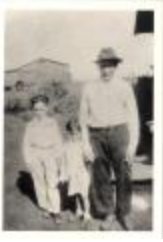
Plantation life (BCSo_b11_f12_0002_front)