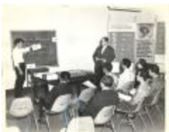
Farm workers learning English (OGPRUS_MD_0030)