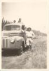
Sugar cane worker and children in the field (BCSo_b12_f08_0006)