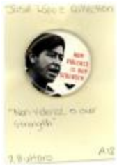
Button: Non-violence is our strength (Button_b04_A12_JoLo_0001)