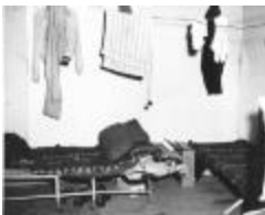
Farmworkers' Beds (OGPRUS_MD_22_0001)