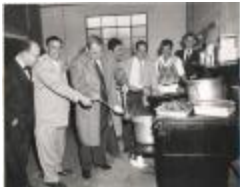
Governor Luis Muñoz Marín visiting farm workers's kitchen (OGPRUS_MD_0047)