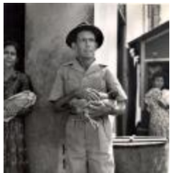
Agricultural worker with chicken (OGPRUS_OIPR_b3330_f56_0001)