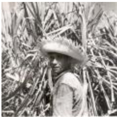
Agricultural worker in sugar cane field (OGPRUS_OIPR_b3331_f10_0001)