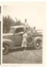
Family on a truck in a sugar cane field (BCSo_b12_f09_0023)