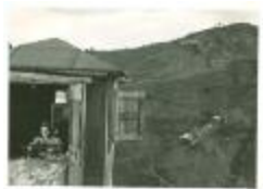
Rural farm worker sewing in her home