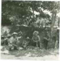
Agricultural Workers (OGPRUS_OIPR_b3312_f38_0001)