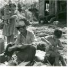
Rural family at home (OGPRUS_OIPR_b3334_f30_0001)