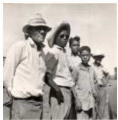
Agricultural workers (OGPRUS_OIPR_b3331_f35_0001)