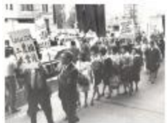
Protest in Support of Farm Workers (KaAn_b_f23_0004)