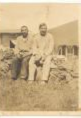
Two men sitting on a ledge (BCSo_b12_f08_0007)