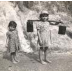
Rural children carrying pails for farm work (OGPRUS_OIPR_b3334_f46_0001)