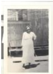
Woman in a Hawaiian sugar cane plantation (BCSo_b12_f11_0004)