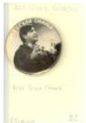
Button: Free Cesar Chavez (Button_b04_B2_JoLo_0001)