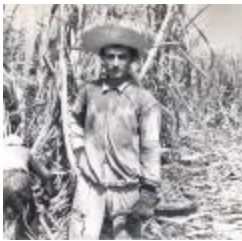
Agricultural worker in sugar cane field (OGPRUS_OIPR_b3331_f09_0001)