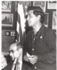
Cesar Chavez (KaAn_b_f24_0004)