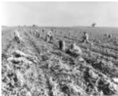
Farmworkers in the Field (OGPRUS_MD_22_0004)