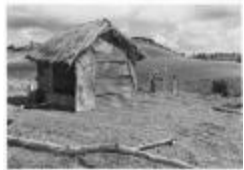
Building new homes on "parcelas" (OGPRUS_OIPR_b3310_f05_0001)