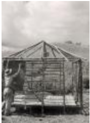
Building new homes on "parcelas" (OGPRUS_OIPR_b3310_f04_0001)