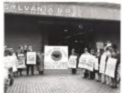
Delano Grape Strike (KaAn_b_f23_0006)