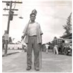
Agricultural worker with shovel (OGPRUS_OIPR_b3331_f04_0001)