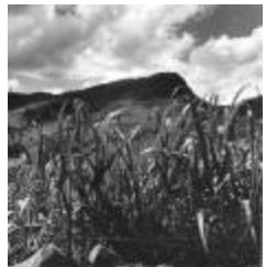
Puerto Rico Farm Land (OGPRUS_OIPR_0368)