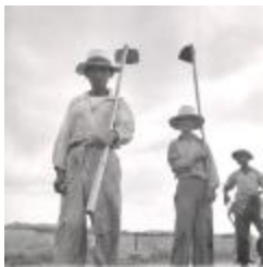
Agricultural workers with hoes (OGPRUS_OIPR_b3331_f06_0001)