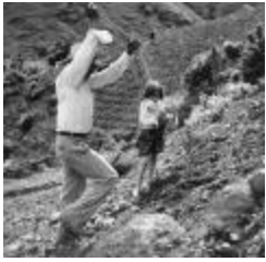
Migrant Farm Workers (OGPRUS_OIPR_0476)