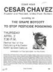
The Santiago Iglesias Educatinal Society - Flyer, 1971 (EfDi_b01_f10)