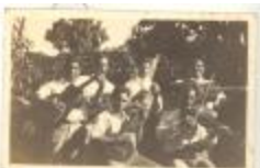
Thomas Negrones and group (BCSo_b12_f10_0001_front)