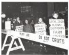
ILGWU Supports Farm Workers (KaAn_b_f23_0005)