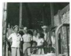
Rural family at home (OGPRUS_OIPR_b3334_f14_0001)