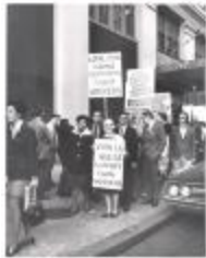
Protest in Support of Farm Workers (KaAn_b_f23_0003)