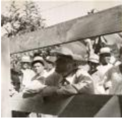
Rural agricultural workers (OGPRUS_OIPR_b3330_f53_0001)