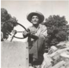
Agricultural worker on tractor (OGPRUS_OIPR_b3331_f13_0001)