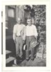
Two men posing in formal clothing in a Hawaiian sugar cane plantation (BCSo_b12_f11_0009)