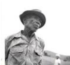
Migrant worker (OGPRUS_OIPR_b3331_f39_0001)