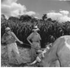
Farm Workers with Ox (OGPRUS_OIPR_5296)