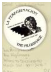
Button: The Pilgrimage, La Peregrinacion (Button_b04_C12_JoLo_0001)