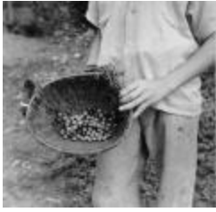
Farm Worker with Crops (OGPRUS_OIPR_3057)