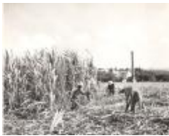
Sugar cane workers in the field (OGPRUS_OIPR_b3331_f19_0001)