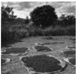
Sod for Farming (OGPRUS_OIPR_1040)