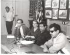
Cesar Chavez at a meeting with ILGWU (KaAn_b_f24_0001)