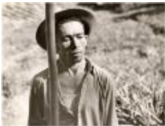
Rural Portrait (OGPRUS_OIPR_b3330_f46_0001)