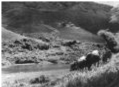
Agricultural Farmer with Cows (OGPRUS_OIPR_0426)