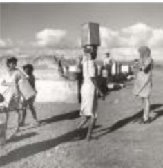
Rural family at work (OGPRUS_OIPR_b3334_f38_0001)