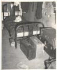
Sleeping Quarters (OGPRUS_MD_b21_fCg3-8_0001)