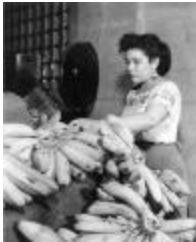
Woman Processing Bananas (OGPRUS_MD_b21_fcg3-2_0001)