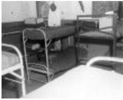
Farmworkers' Beds (OGPRUS_MD_22_0002)