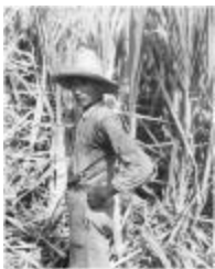
Sugar cane worker (OGPRUS_OIPR_b3331_f17_0001)