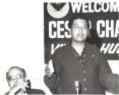
Cesar Chavez (KaAn_b_f24_0003)