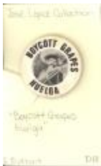
Button: Boycott Grapes. Huelga (Button_b03_D10_JoLo_0001)