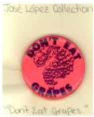
Don't Eat Grapes (Button_b03_C11_JoLo_0001)