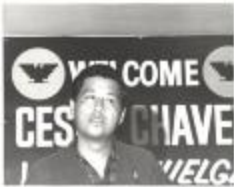
Cesar Chavez (KaAn_b_f24_0002)