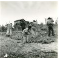
Farm workers with hoes (OGPRUS_OIPR_b3374_f01_0001)