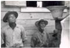
Resettlement of "Agregados" (OGPRUS_OIPR_b3309_f46_0001)