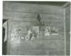
Home of sugar worker (OGPRUS_OIPR_b3334_f10_0001_front)