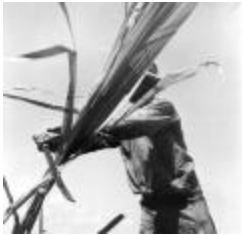
Planting, weeding, sugarcane (OGPRUS_OIPR_b3303_f18_0001)