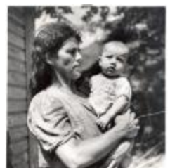
Farm worker and her infant child (OGPRUS_OIPR_b3332_f45_0001)