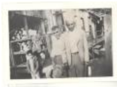
Two men posing for the camera while two children look at them (BCSo_b12_f11_0008)