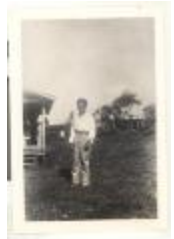
Man in a Hawaiian sugar cane plantation (BCSo_b12_f11_0002)