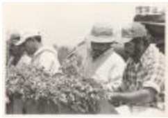
Migrant Farm Workers (OGPRUS_MD_boxunknown_fCa_0001)