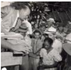
Resettlement of "Agregados" (OGPRUS_OIPR_b3309_f20_0001)