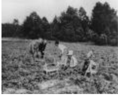
Farmworkers in Pavas, Costa Rica (OGPRUS_MD_22_0003)