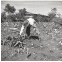
Farm worker gardening (OGPRUS_OIPR_b3376_f11_0001)