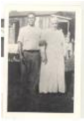
Man and woman in a Hawaiian sugar cane plantation (BCSo_b12_f11_0006)