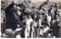
Land Authority Program (OGPRUS_OIPR_b3309_f43_0001)