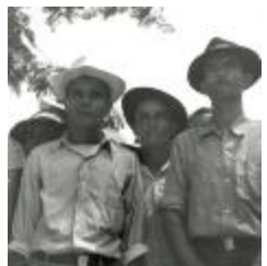
Resettlement of "Agregados" (OGPRUS_OIPR_b3310_f37_0001)