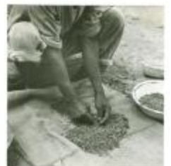
Farm worker sorting through coffee beans (OGPRUS_OIPR_b3334_f17_0001)