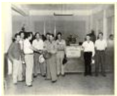
Farm Workers Recruited In Caguas (OGPRUS_MD_b21_fCg3-10_0001)