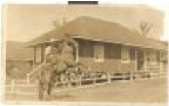
Uncle Juanito on a horse (BCSo_b12_f08_0008_front)