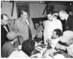
Luis Muñoz Marín Visiting Farm Labor Workers (OGPRUS_MD_b23_fDa19-5_0002)