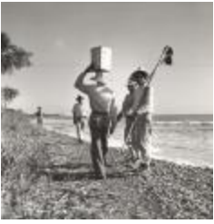
Coffee farmers (OGPRUS_OIPR_b3334_f24_0001)