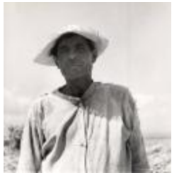
Rural portrait (OGPRUS_OIPR_b3331_f07_0001)