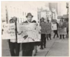
Protesting The Migration Division's Farm Labor Recruitment Program (OGPRUS_MD_b18_f01_0001)