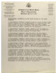
Environmental Initiatives in the First Session of the 103rd Congress (RiPe_b19_f08_0008_pg01)