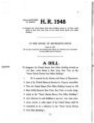
H.R 1948 100th Congress 1st Session (OGRI_b01_f04_0001)