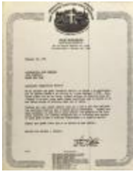
Correspondence from the Hispanic Ministers Organization, Inc. (RiPe_b19_f04_0010)