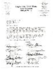
Correspondence to Fidel Castro from the Congressional Hispanic Caucus (RoGa_b45_f16_0003_pg01-07)