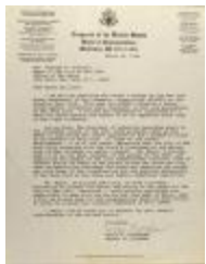
Correspondence from Nydia Velázquez (RiPe_b19_f08_0015)