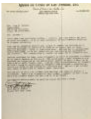
Correspondence from Iglesia de la Cristo en Las Antillas (RiPe_b19_f04_0002)