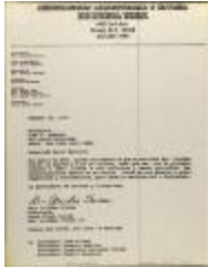
Correspondence from Asociación de Ministerial Y Cívica de Nueva York / New York Ministrat and Civic Association (RiPe_b19_f04_0011)