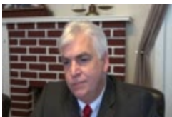
Interview with John Quinones on January 19, 2017, Segment 6 (JQui.2017.01.19.6)