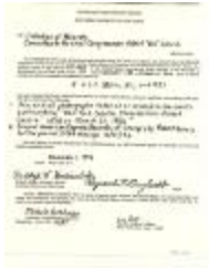
Court Subpoena to Committee to Re-Elect Congressman Robert Garcia (RoGa_b51_f15_0001)