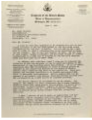
Correspondence from Nydia Velázquez (RiPe_b19_f08_0012_pg01)