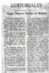
Algo Nuevo Sobre El Status / Something New about the Status (OGPRUS_MD_0055)