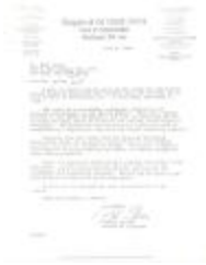
Correspondence to Raul Julia from Robert Garcia (RoGa_b46_f11_0001)