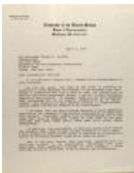
Correspondence from Nydia Velázquez (RiPe_b19_f08_0011_pg01)