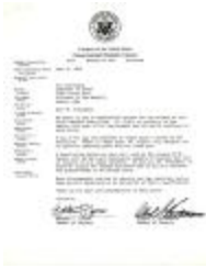
Correspondence to Fidel Castro from the United States Congress (RoGa_b45_f16_0001_pg01)