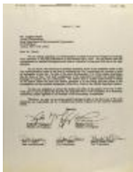
Correspondence from Nydia Velázquez (RiPe_b19_f08_0014)