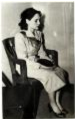
Lolita Lebrón after the nationalist attack on Congress (RMRe_b38_f05_0001)