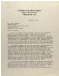
Correspondence from the United States Congress (RiPe_b19_f08_0010_pg01)