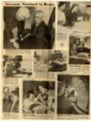
Gunman Subdued in House (OGPRUS_OIPR_b3298_f05_0001)