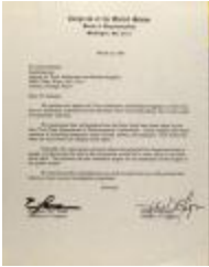
Correspondence from Nydia Velázquez (RiPe_b19_f08_0013)