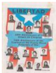
Libertad publication cover of the 40th Anniversary of the Attack on Congress (JoEV_b07_f12_0001)