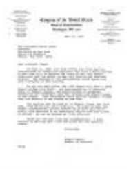
Correspondence to Mario Cuomo from Robert Garcia (RoGa_b02_f18_0003)