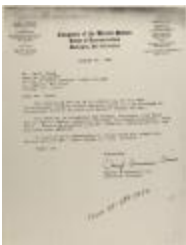
Correspondence from the United States Congress (RiPe_b17_f08_0003_pg01)