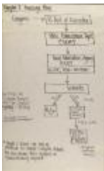
Chapter 1 Funding (RiPe_b17_f10_0004_pg01)