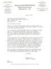
Correspondence to Eleanor Holmes Norton from Robert Garcia (RoGa_b03_f12_0001)