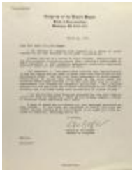
Correspondence from Nydia Velázquez (RiPe_b19_f08_0009)