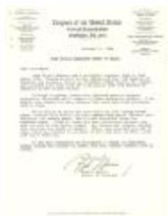
José Pujals Medero Released after 27 Years (RoGa_b07_f05_0001)