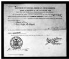
Certificate of Election, Member of State Committee (JeCo_b01_f04_0085)