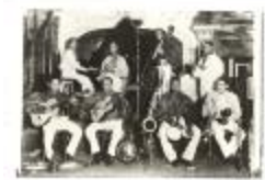
Machito and Grupo Redención (CaOr_b20_f09_0016)