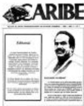
Caribe newsletter of the CUNY Association of Caribbean Studies (CACAS_b01_f03_004)