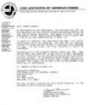
CUNY Association of Caribbean Studies membership letter regarding nomination polls for Executive Committee members (CACAS_b01_f03_003)