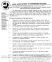
Terms of Reference of the Standing Committee for University exchange programs, CUNY Association of Caribbean Studies (CACAS_b01_f03_002)