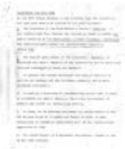
CUNY ASSOCIATION OF CARIBBEAN STUDIES ANNUAL REPORT 1985-1986 (CACAS_b01_f03_005)