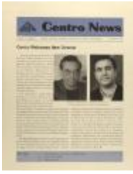
Centro News (RiPe_b25_f09_0023_pg01)