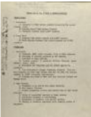
Teach-In on the State of Urban Wisdom (RiPe_b27_f01_0023_pg01)