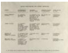
Action Taken Against CUNY Student Protesters (RiPe_b27_f01_0002_pg01)