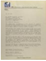
Correspondence from Bronx Voter Participation Project (RiPe_b27_f01_0014_pg01)