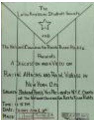
Racial Attacks and Racial Violence in New York City (RiPe_b20_f03_0022)