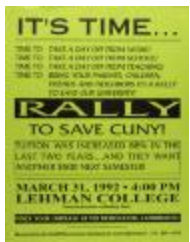
Rally to Save CUNY! (RiPe_b20_f03_0077)