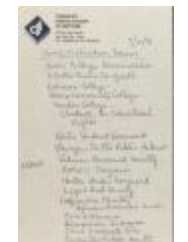
CUNY Evaluation Forum (RiPe_b28_f07_0027)