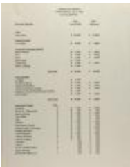
Comité Noviembre - Third Annual Gala 1998 - Status Report (RiPe_b27_f06_0014_pg01)