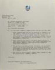
?Correspondence from Bronx Voter Participation Project (RiPe_b27_f01_0016)