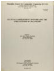
ECCO's Accomplishments in Increasing the Effectiveness of Organizers (RiPe_b26_f06_0012_pg01)