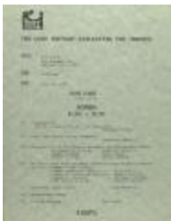
The CUNY Protest - Evaluating The Process - Agenda (RiPe_b27_f01_0022)