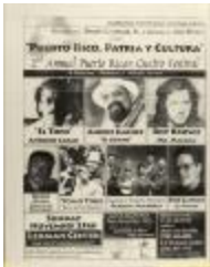
Puerto Rico, Patria, y Cultura (RiPe_b20_f02_0076)