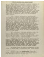
The CUNY Emergency Legal Defense Project - Report (RiPe_b26_f05_0004_pg01)