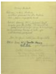
CUNY Students (RiPe_b26_f05_0002)