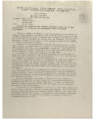
The Lehman College Students for Educational Rights (RiPe_b26_f04_0003_pg01)