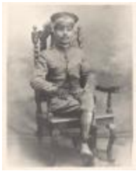
Pedro Albizu Campos with his ROTC uniform (RMR_b38_f01_488)