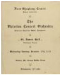
First Symphony Concert of the Victorian Concert Orchestra (PuBe_b22_f09_0003_cover)