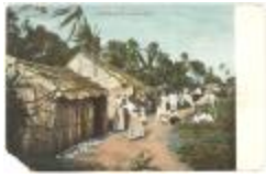
Native Huts, Porto Rico (Centro_POST_b01_HOU_3_front)