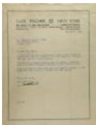
Correspondence to Clarence Cameron White (PuBe_b22_f03_0009_r)