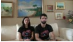
Interview about Jurakán documentary on October 21, 2018 (JUR.2018.10.21)