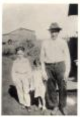
Plantation life (BCSo_b11_f12_0002_front)