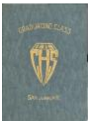
Graduating Class 1919 (PuBe_b02_f04_0003_pg01)