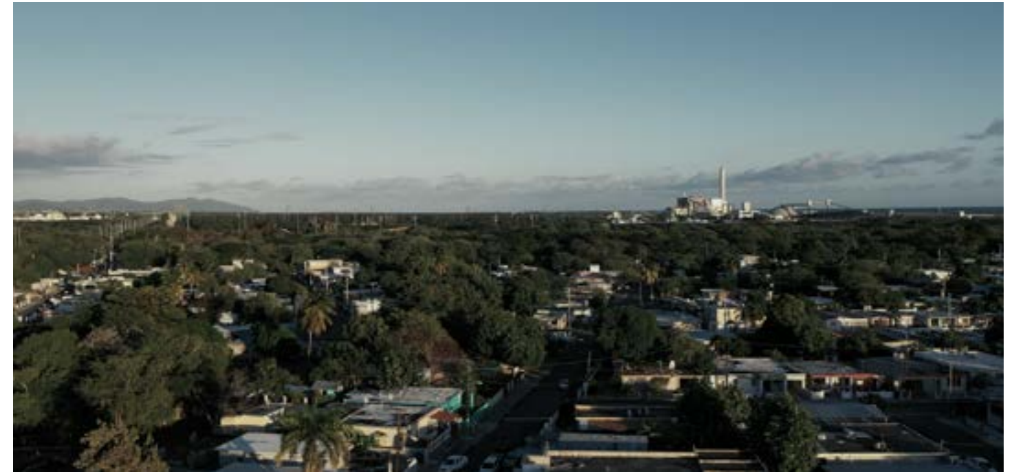
Still of Burning Ashes